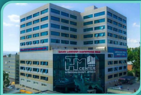
HIGH TECHNOLOGY MEDICAL CENTRE, UNIVERSITY CLINIC