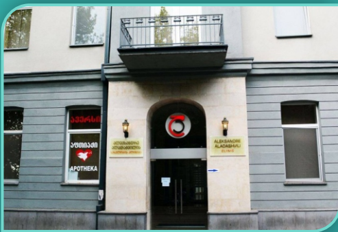
Aleksandre Aladashvili University Clinic

>East-west Teaching University own Three Practicing Hospitals for better learning experience