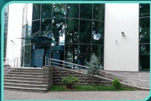
CHICHUA MEDICAL CENTER MZERA